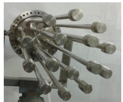
Particular of a Pd-membrane module (15 tubes) before assembling

Researches at ENEA Frascati about Pd-membrane are carried out since 90's years in the frame of the programmes EFDA and then EUROfusion and in collaboration with CEA Cadarache and KIT (former TLK) Institutes. In this field, ENEA developed a relevant expertise moving from material development (diffusion bonding of Pd-Ag sheet for realizing thin-wall permeator tubes), then designing innovative Pd-membrane reactor (single and multi-tube finger-like configurations, heating systems, Pd-tubes joining) and, finally, developing detritiation processes via membranes.