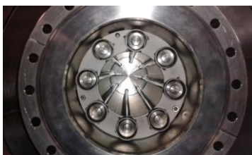
Internal view of the multi-tube membrane reactor built by ENEA for CEA laboratories (2017).

When applied for the production of hydrogen via reforming, due the continuous removal of hydrogen (one of the reaction products) the Pd-membrane reactors are expected to work with reaction conversions higher than those achievable by traditional reactors or, in alternative, can yield the same amount of hydrogen but operating at lower temperature. For instance, the same hydrogen yield (around 50%) in ethanol steam reforming has been obtained in Pd-membrane reactors at 450 °C much below the operating temperature of traditional reformers (700-800 °C) thus involving significant advantages in terms energy efficiency and cost reduction